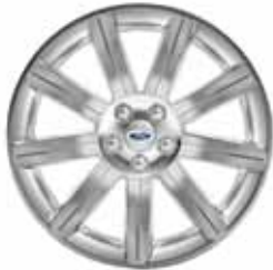
19" Polished Aluminum Standard

1 Medium Light Stone Leather with Perforated Inserts – Standard 2 Charcoal Black Leather with Perforated Inserts – Standard