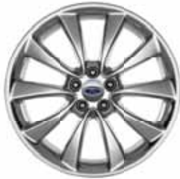
20" Polished Aluminum Standard

1 Charcoal Black Leather with Gray Alcantara® Suede Perforated Inserts