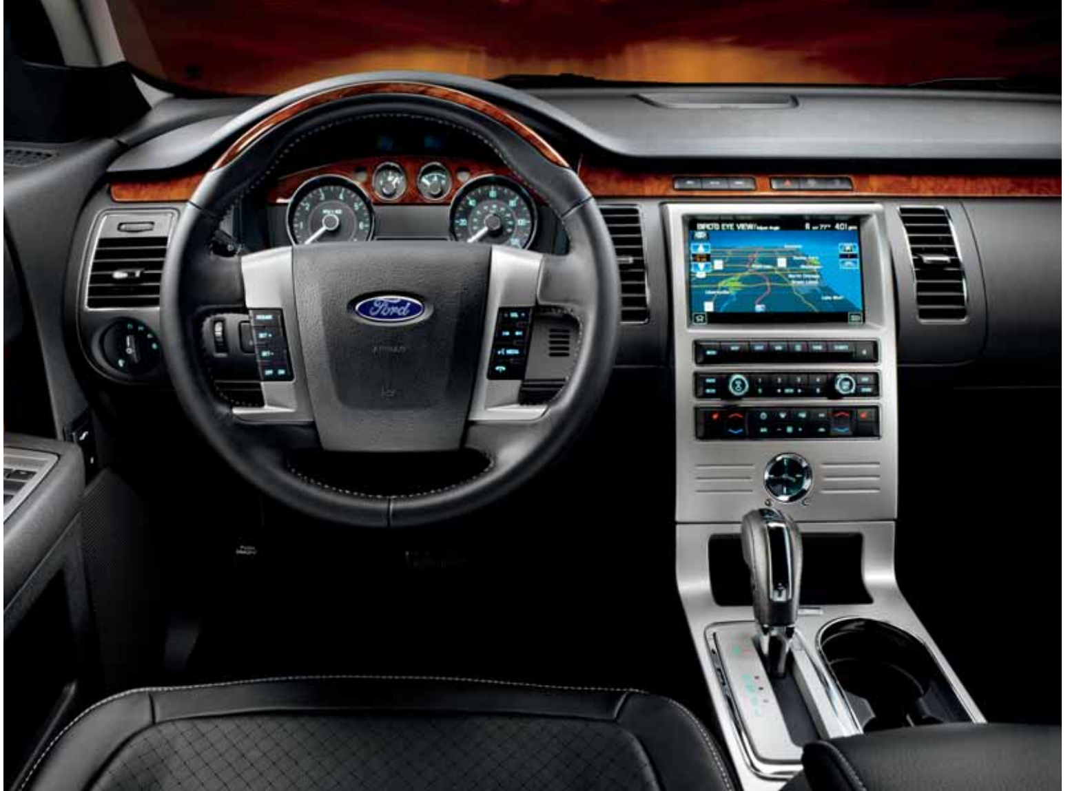
Charcoal Black leather trim with perforated inserts. Available equipment. | Medium Light Stone leather trim with perforated inserts. | Power liftgate. | Refrigerated 2nd-row console! | 110-volt power outlet. | Ingot Silver Metallic. White Suede roof. Available equipment.