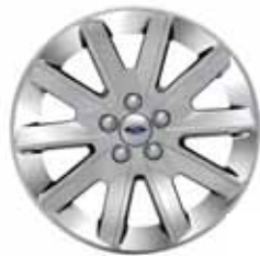
18" Machined Aluminum Standard on SEL