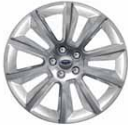
20" Bright-Painted Aluminum Optional on 300A, included with 301A and 302A