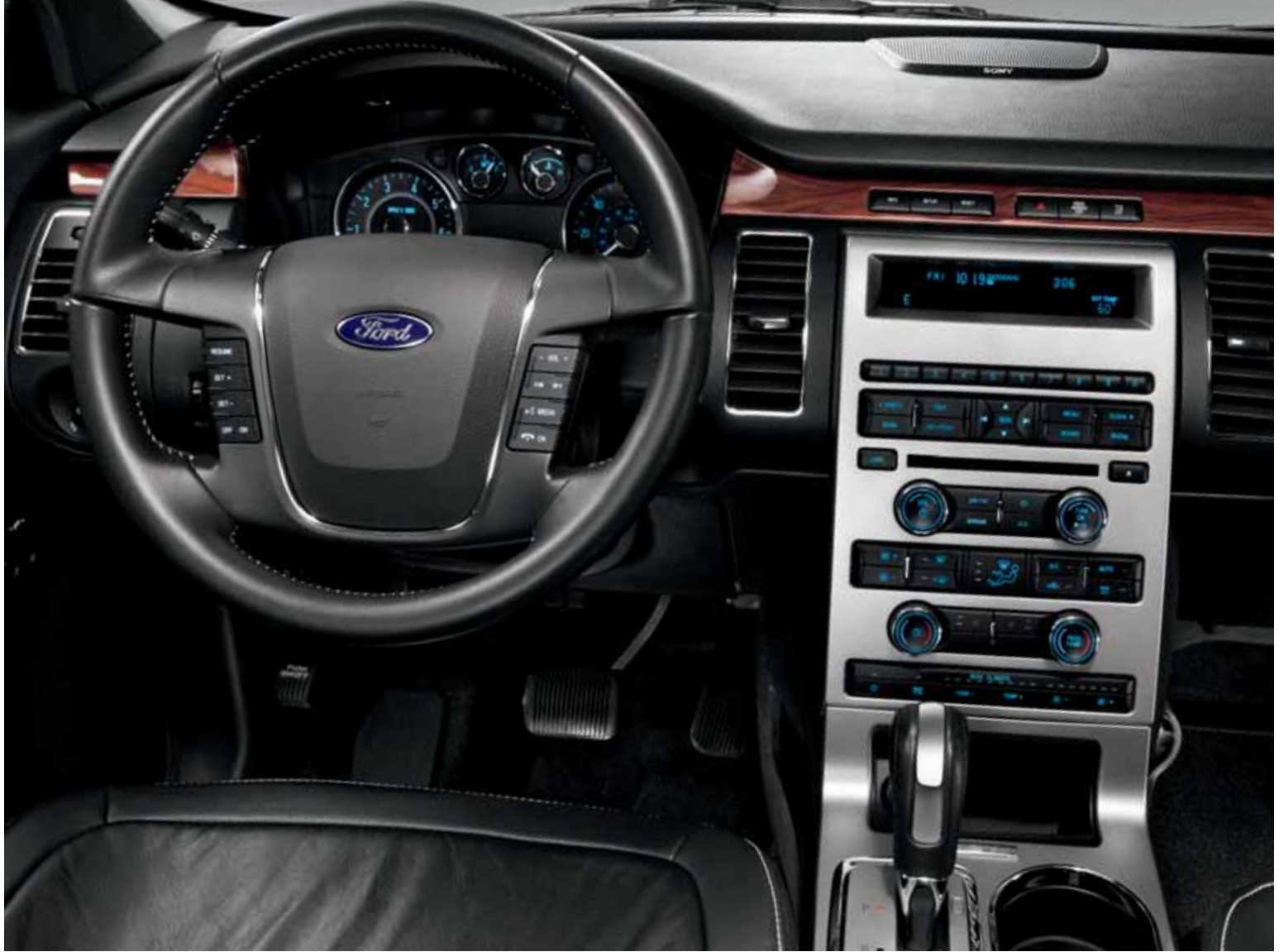
SEL. Charcoal Black leather trim. Available equipment. | SE. Charcoal Black cloth trim with houndstooth-patterned inserts. | SEL. Cargo net. | Ford SYNC! | Woodgrain appliqué. | SEL. Dark Blue Pearl Metallic. Available equipment.