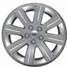
17" Painted Aluminum Standard on SE

1 Medium Light Stone Cloth with Houndstooth-Patterned Inserts – Standard 2 Charcoal Black Cloth with Houndstooth-Patterned Inserts – Standard 3 Medium Light Stone Leather – Optional 4 Charcoal Black Leather – Optional