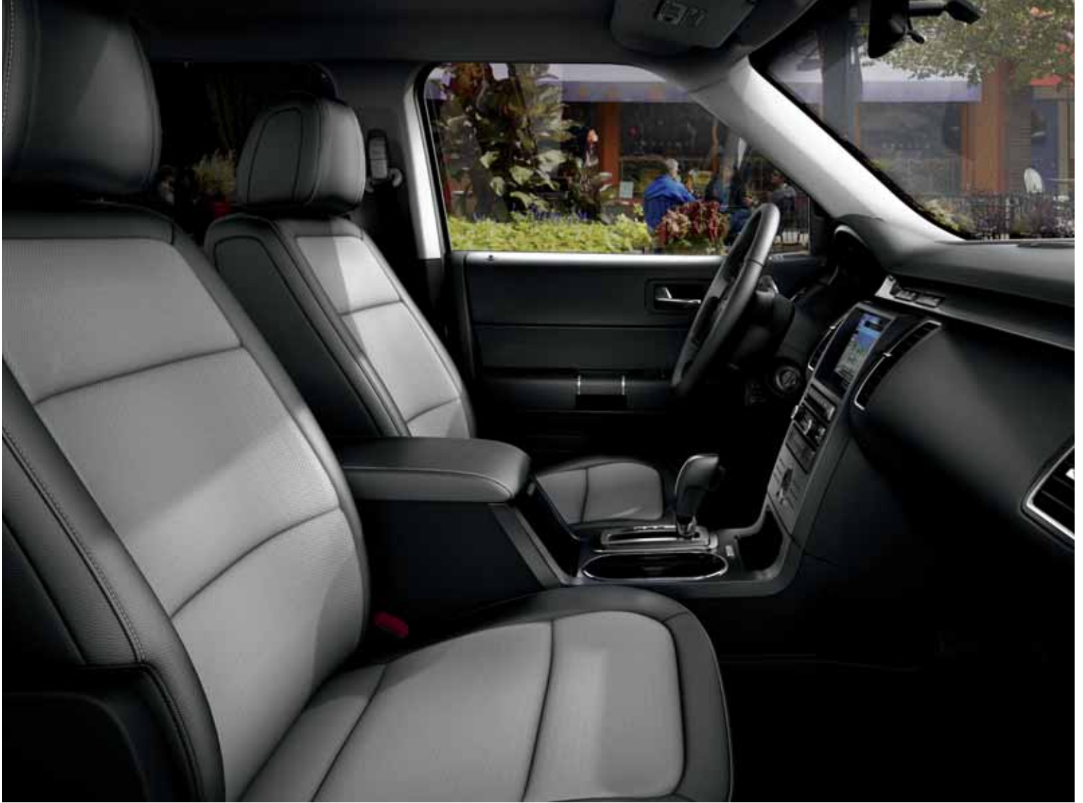
Charcoal Black leather trim with Gray Alcantara® suede perforated inserts. Available equipment. | Illuminated front door-sill scuff plates. | Paddle shifters. | Black "FLEX" hood badge. | Instrument panel Circle Check-appearance trim inserts. | White Platinum Metallic Tri-coat. Black roof.